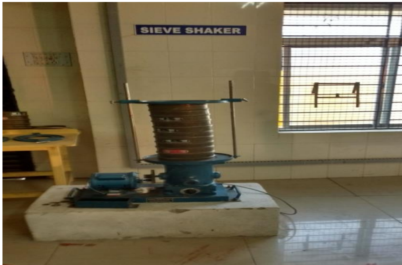
Fig.2 Sieve analysis of fine aggregate

The sample shall be brought to an air dry condition by either drying at room temperature or heating at a temperature of 100° C to 110° C. Sample for sieving shall be prepared by either quartering or by means of sample divider. Take proper weight of dries fine aggregate of 1000g. Assemble IS sieves in following order 4.75mm, 2.36mm, 1.16mm, 600 \mu , 300 \mu , 150 \mu , and pan place the aggregates in the top of the sieves and cover with the lid properly secure the sieves in the mechanical shaker and turn on the shaker or shake manually for five minutes. Compute the cumulative percent retained on and the percent passing each sieve